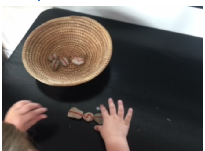
Writing Center: Rocks with Lines