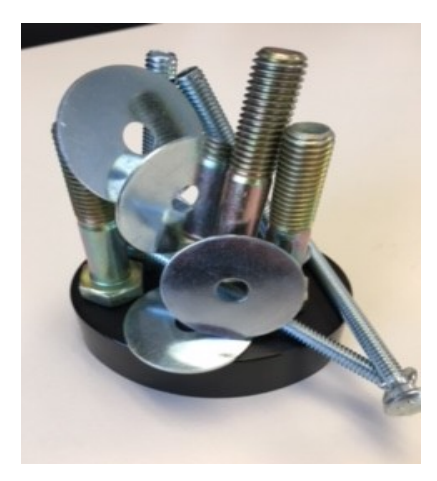
Science Center: Magnets, Nuts, Bolts and Washers