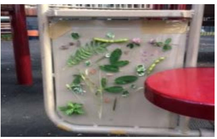
Outdoors / Playground / Gross Motor: Contact Paper Sticky Wall