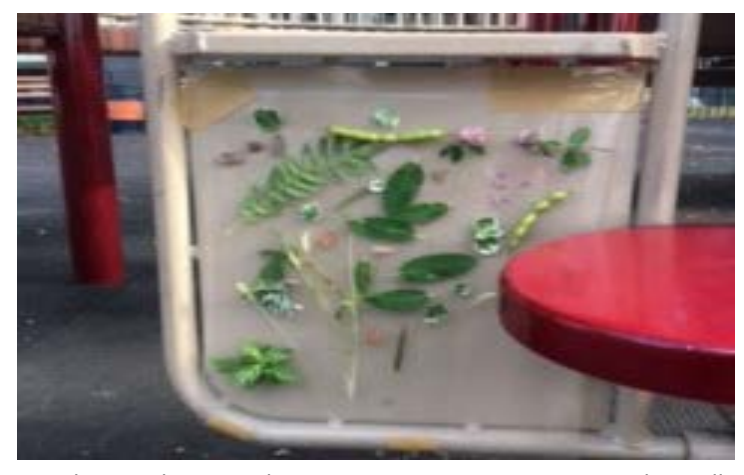
Outdoors / Playground / Gross Motor: Contact Paper Sticky Wall