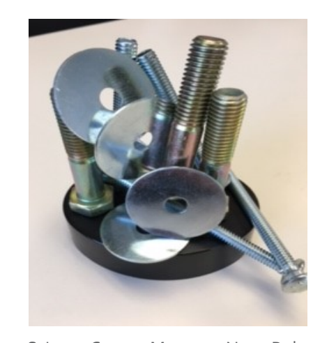
Science Center: Magnets, Nuts, Bolts and Washers