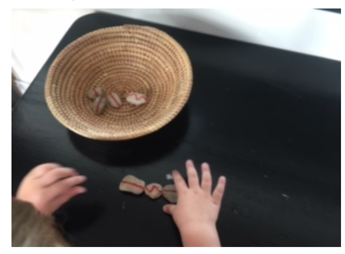
Writing Center: Rocks with Lines