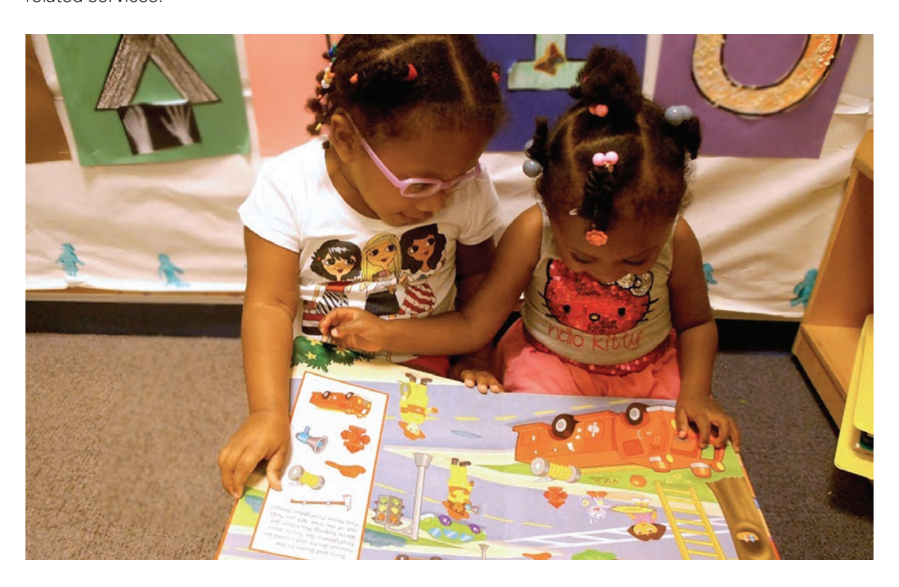
Inclusive settings allow children with and without disabilities to learn alongside one another.