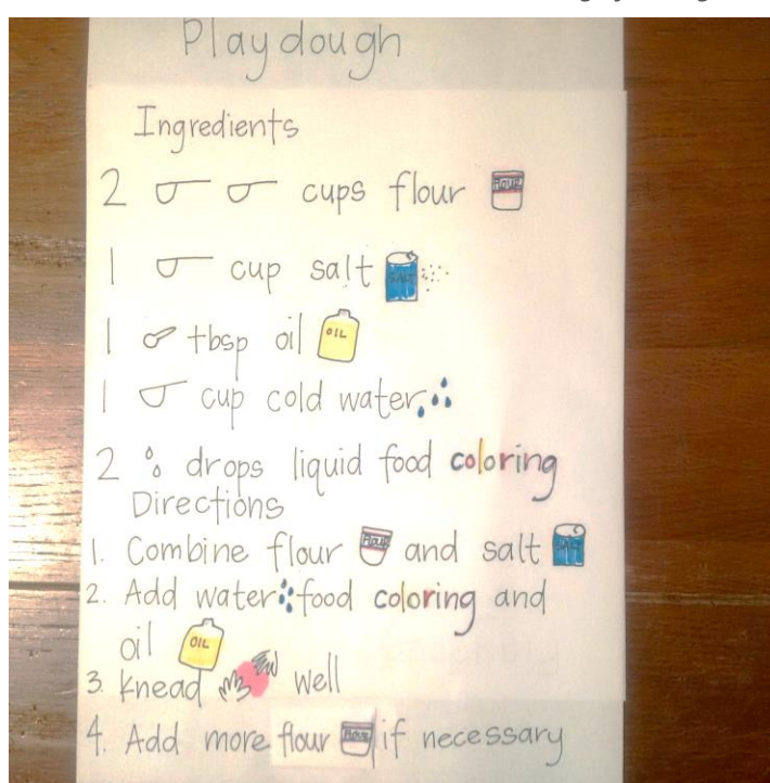
PK.ELAL.1. [PKRF.1.] Demonstrates understanding of the organization and basic features of print

When cooking with children in the classroom, use recipes that children can follow. Use words, symbols and pictures to help develop children's emerging literacy skills. Read the recipe and point to each step with the children as you support the cooking experience.